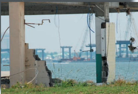
Progress on the new Biloxi-Ocean Springs bridge can be seen through the remains of Ocean Springs Seafood on Front Beach.