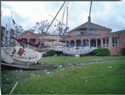
Boats rest in a yard in Ocean Springs, Miss., after Hurricane Katrina.

The Mississippi-Alabama Sea Grant Consortium has been playing several roles in Hurricane Katrina recovery efforts. The following is a list of MASGC post-Katrina projects that are related to recovery and resiliency.